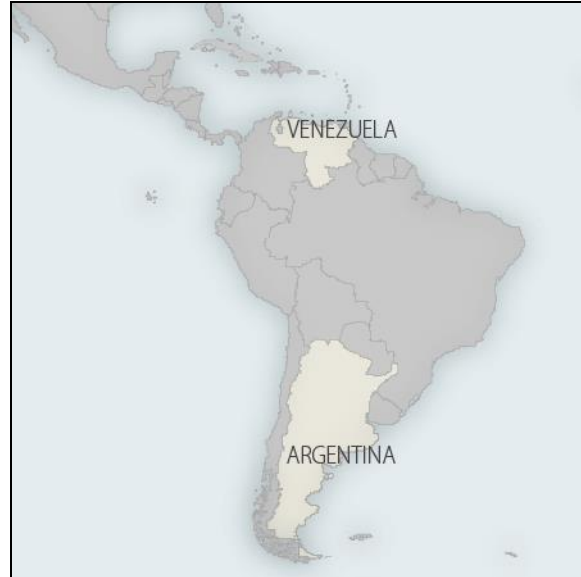
Figure 4. Latin America

Some U.S. officials and some in Congress have expressed concerns about Iran's relations with leaders in Latin America that share Iran's distrust of the United States. Some experts and U.S. officials have asserted that Iran has sought to position IRGC-QF operatives and Hezbollah members in Latin America to potentially carry out terrorist attacks against Israeli targets in the region or even in the United States itself. 153 Some U.S. officials have asserted that Iran and Hezbollah's activities in Latin America include money laundering and trafficking in drugs and counterfeit goods. 154 These concerns were heightened during the presidency of Mahmoud Ahmadinejad (2005-2013), who made repeated, high-profile visits to the region in an effort to circumvent U.S. sanctions and gain support for his criticisms of U.S. policies. However, few of the economic agreements that Ahmadinejad announced with Latin American countries were implemented, by all accounts.