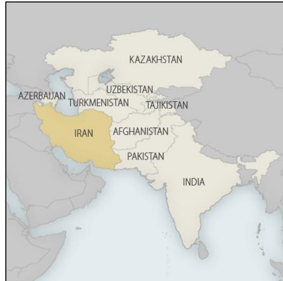
Figure 3. South and Central Asia Region

Most of the Central Asia states that were part of the Soviet Union are governed by authoritarian leaders. Afghanistan remains politically weak, and Iran is able to exert influence there. Some countries in the region, particularly India, seek greater integration with the United States and other world powers and tend to downplay cooperation with Iran. The following sections cover those countries in the Caucasus and South and Central Asia that have significant economic and political relationships with Iran.