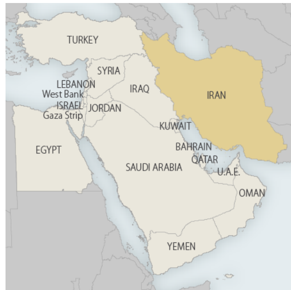
Figure 1. Map of Near East

Several of the GCC leaders have accused Iran of fomenting unrest among Shiite communities in the GCC states, particularly those in the Eastern Provinces of Saudi Arabia and in Bahrain, which