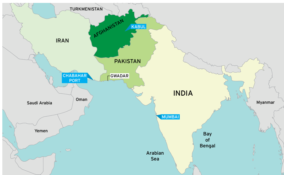
FIGURE 1: CHABAHAR PORT